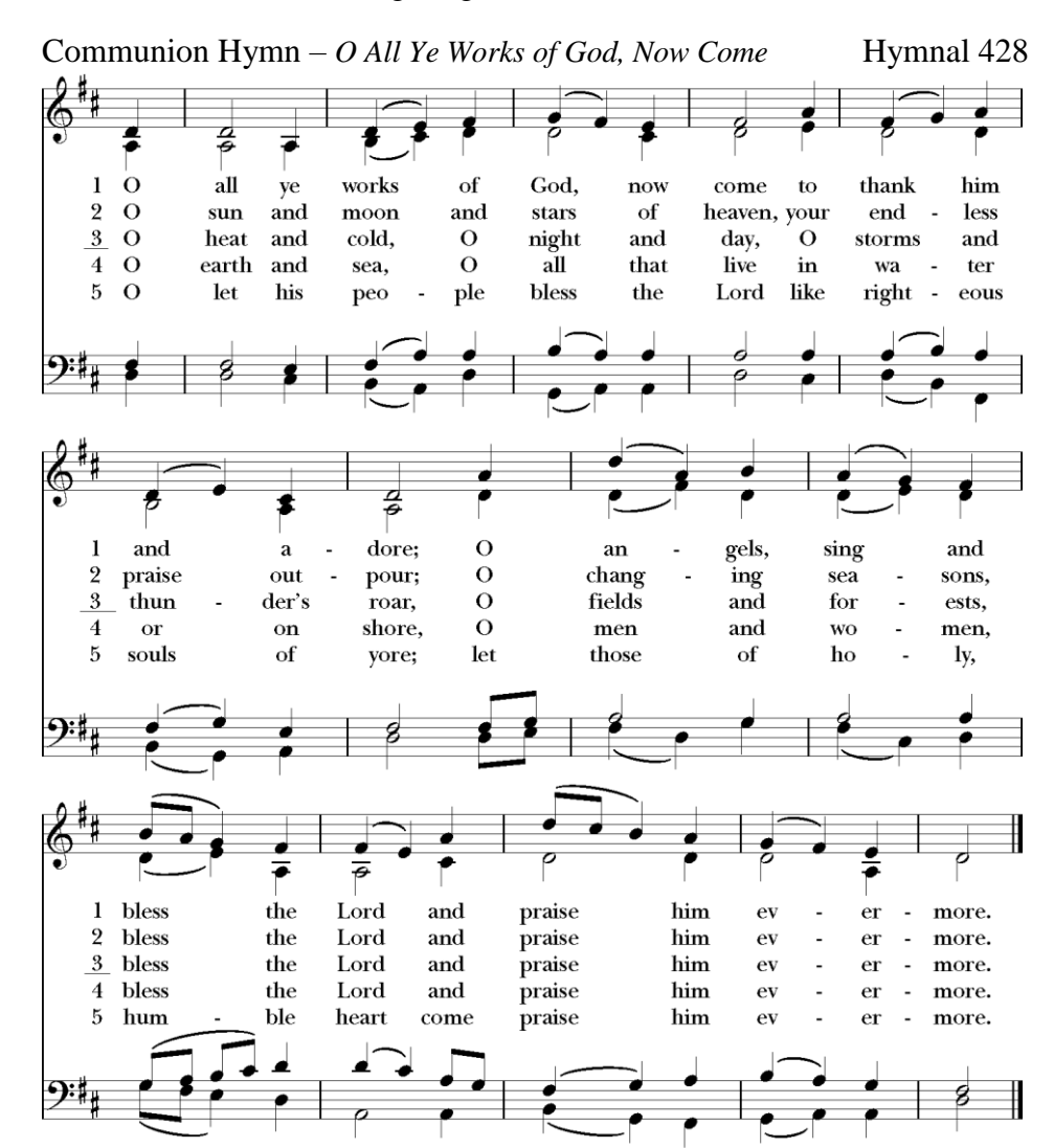
6 So let us glorify and bless the God we bow before, the Father, Holy Spirit, Son, and praise him evermore.

Take them in remembrance that Christ died for you, and feed on him in your hearts by faith, with thanksgiving.