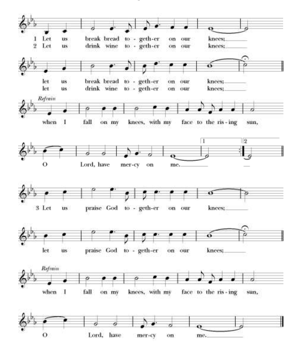
After Communion, the Celebrant says Let us pray.